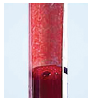
Figure 2. Entire inner surface of tube must be coated with blood.