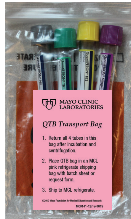
Figure 4. Shipping (Ship QTB kit refrigerate: 2^{\circ}\text{--}8^{\circ}\text{C} )