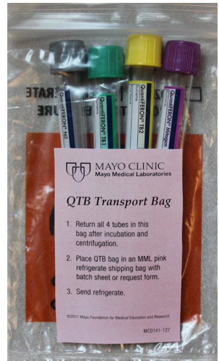
Figure 3. Shipping (Ship QTB kit refrigerate: 2^{\circ}\text{--}8^{\circ}\text{C} )