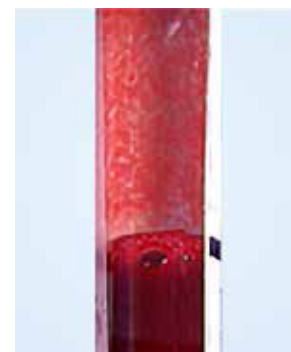
Figure 2. Entire inner surface of tube must be coated with blood.