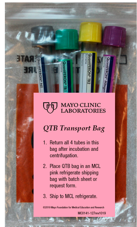
Figure 4. Shipping (Ship QTB kit refrigerate: 2^{\circ}\text{--}8^{\circ}\text{C} )