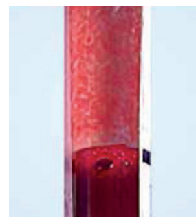
Figure 2. Entire inner surface of tube must be coated with blood.